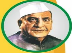
कृषिरत्न शिक्षण महर्षी, डॉ. पंजाबराव उपाख्य भाऊसाहेब देशमुख संस्थापक श्री शिवाजी शिक्षण संस्था, अमरावती