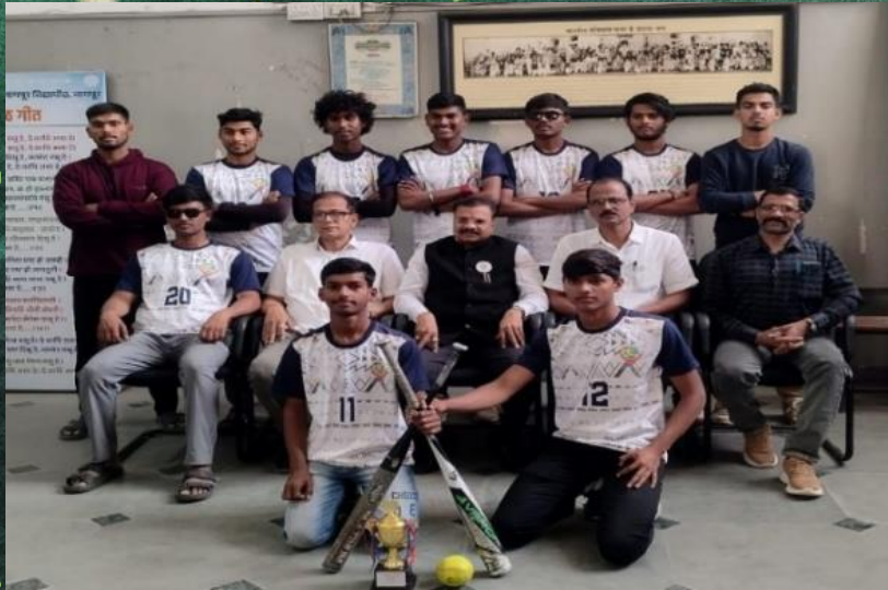
University Baseball Championships 2025-26