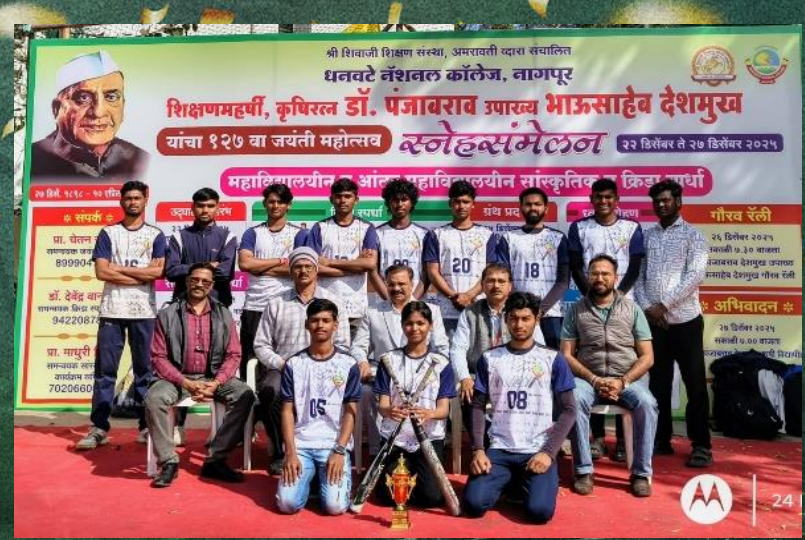
University Softball Championships 2025-26